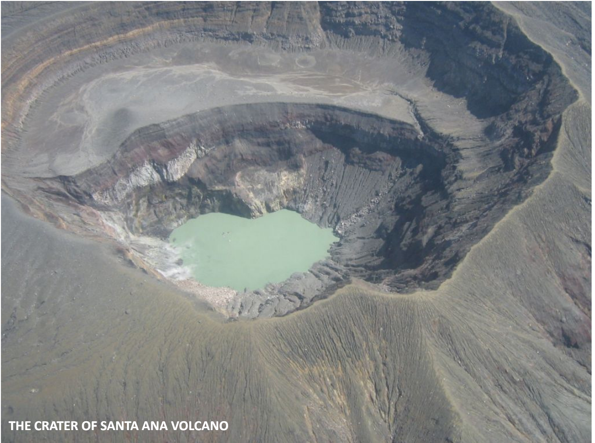
THE CRATER OF SANTA ANA VOLCANO