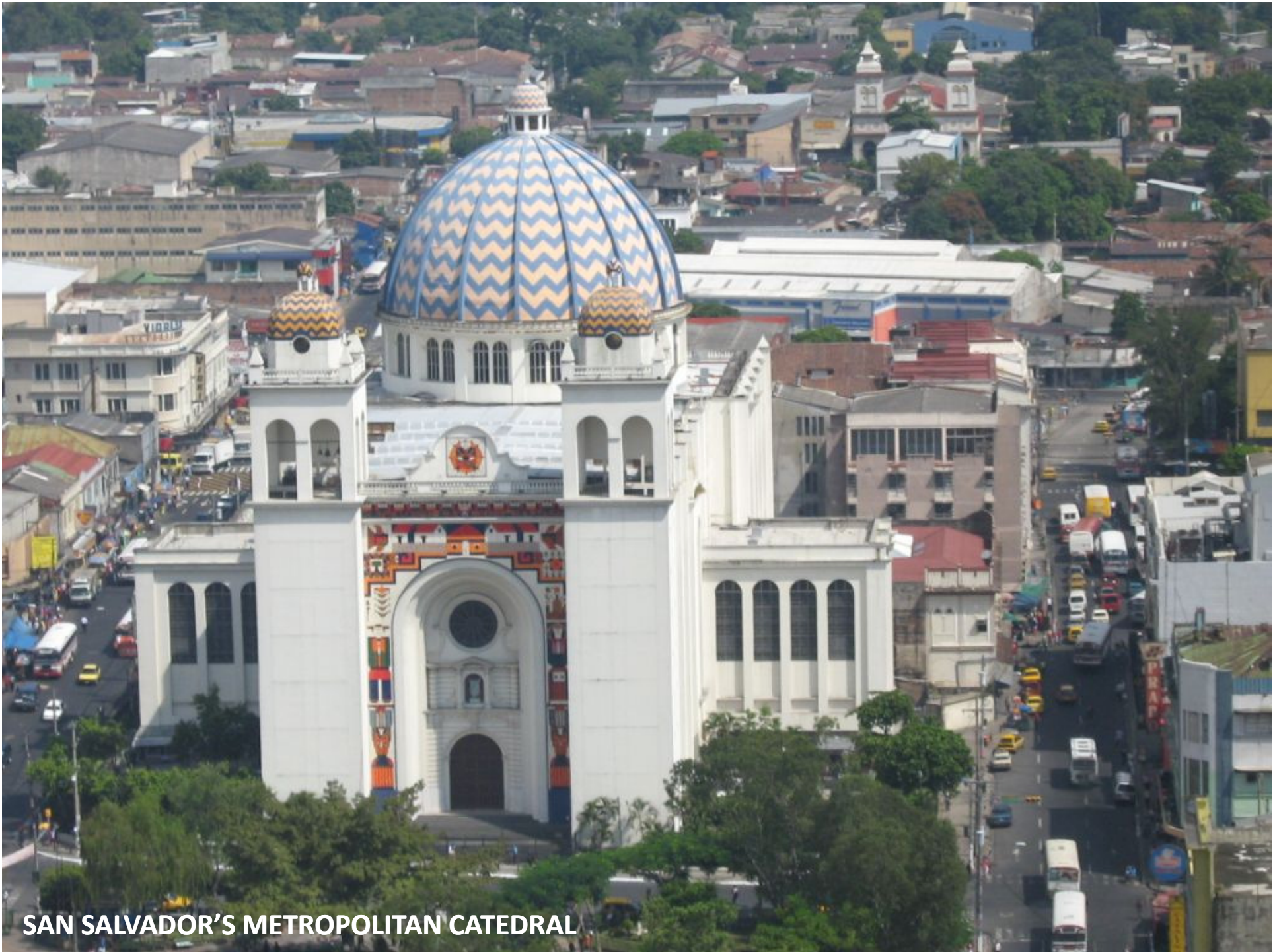
SAN SALVADOR'S METROPOLITAN CATEDRAL