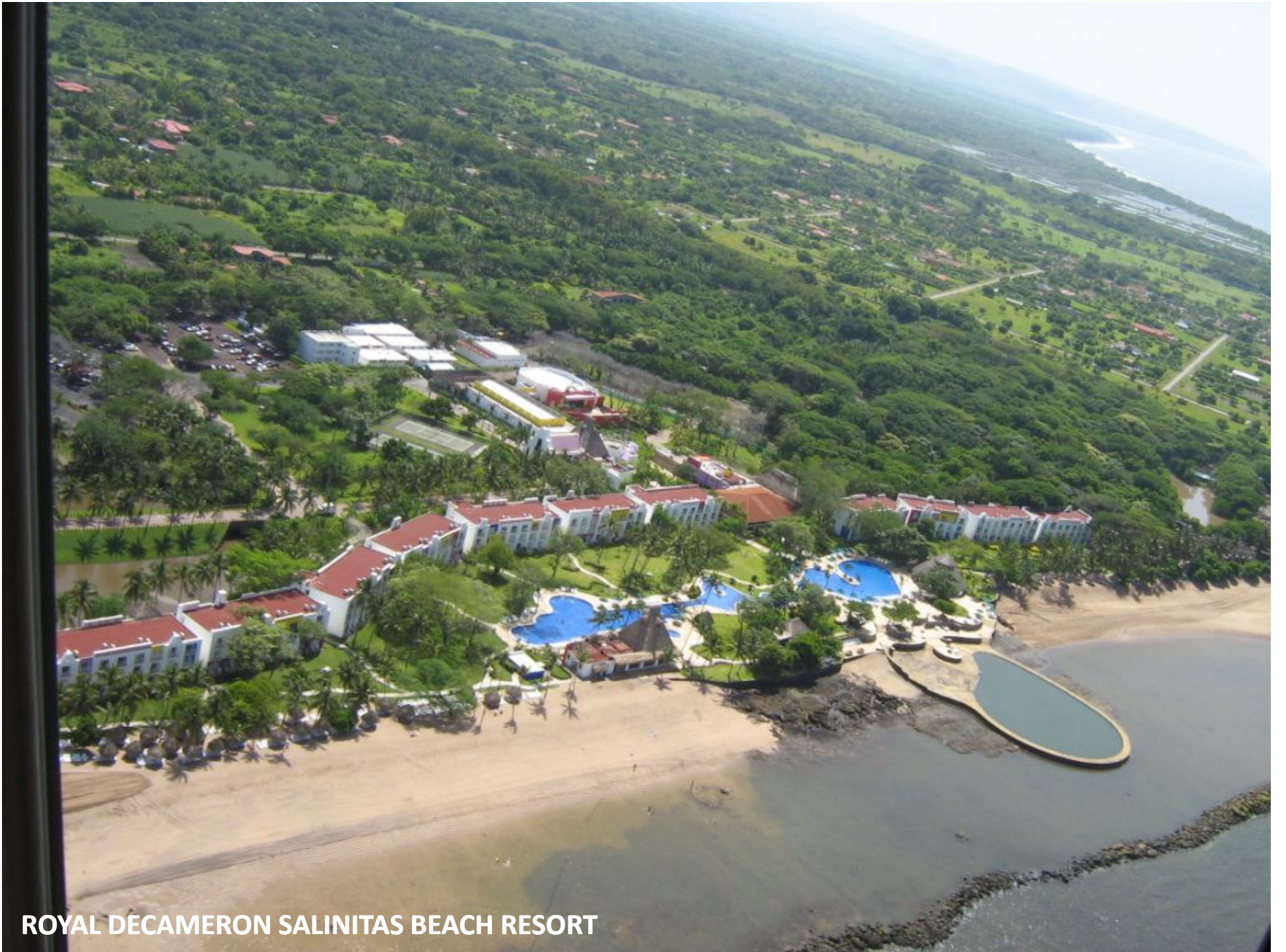
ROYAL DECAMERON SALINITAS BEACH RESORT