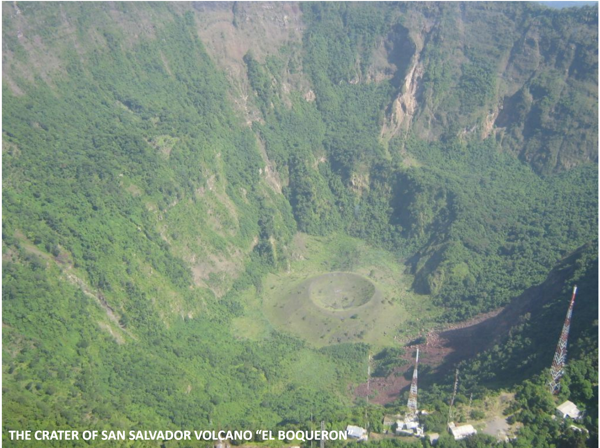
THE CRATER OF SAN SALVADOR VOLCANO "EL BOQUERON"