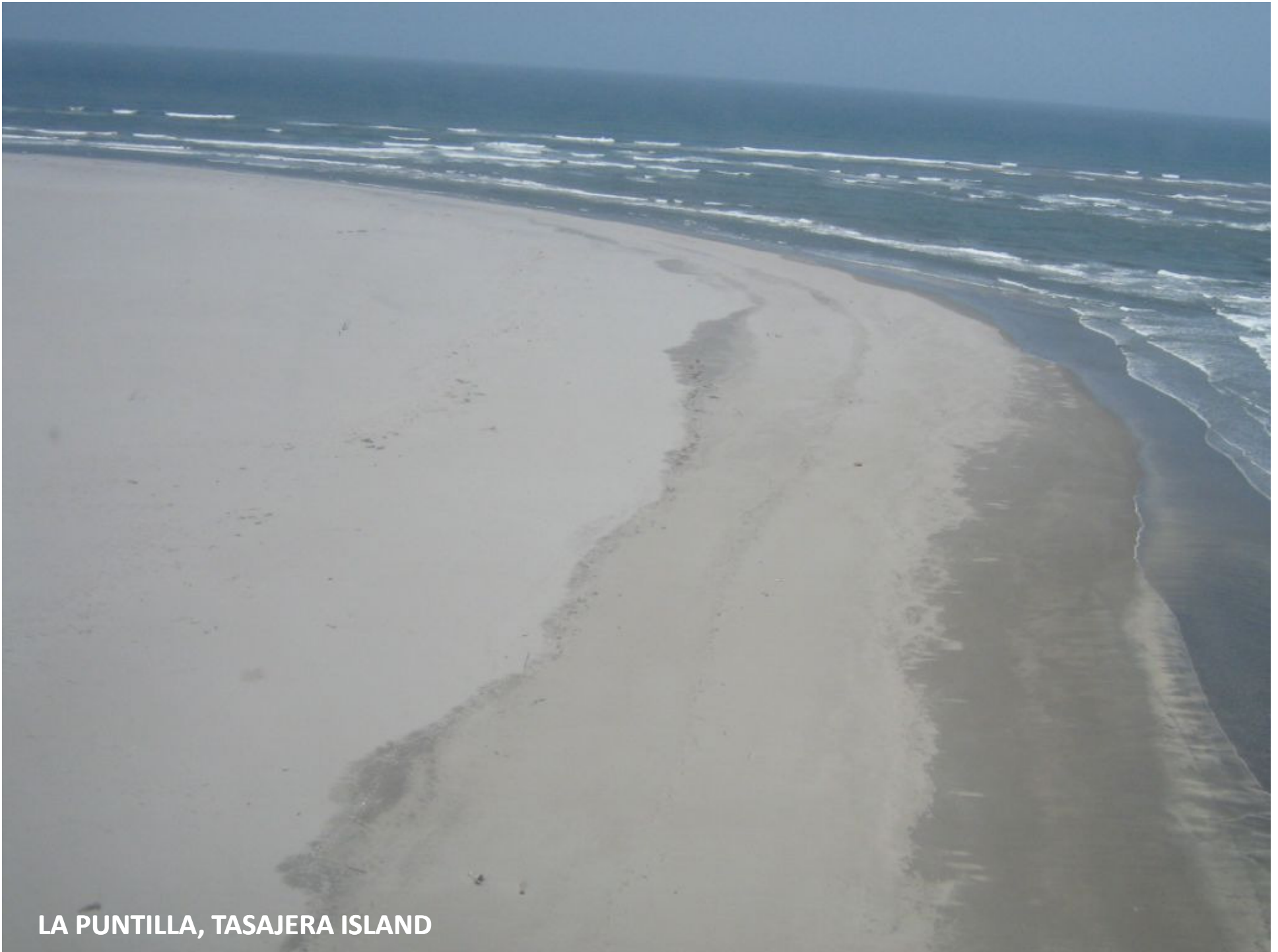
LA PUNTILLA, TASAJERA ISLAND