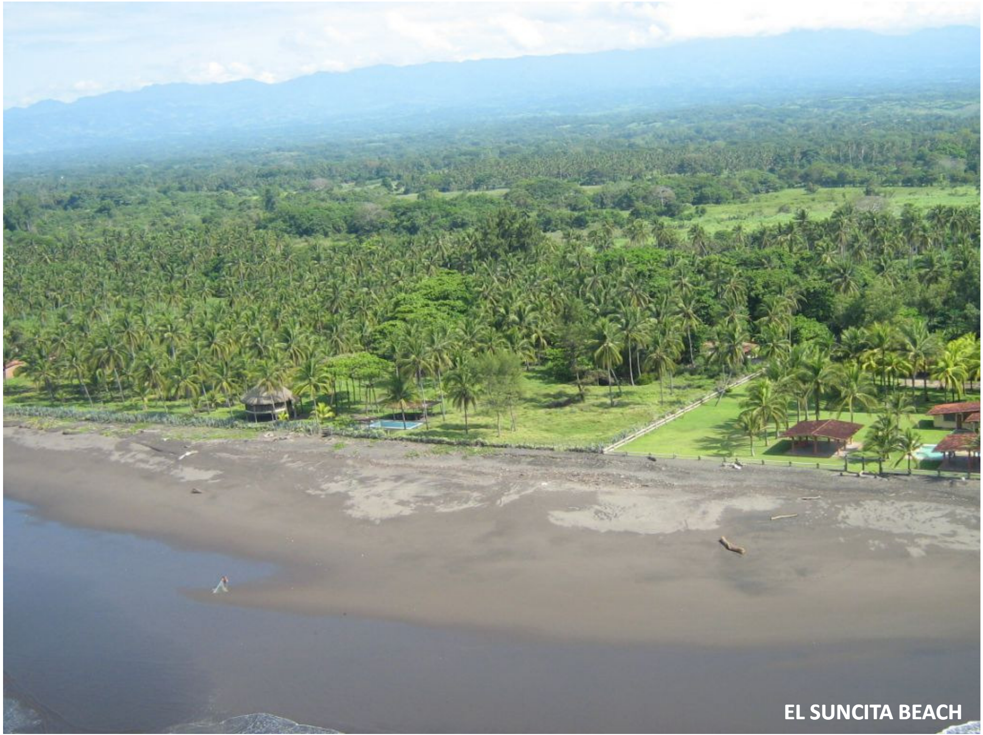
EL SUNCITA BEACH