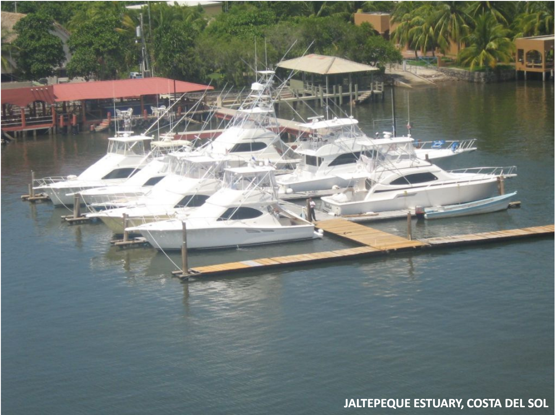
JALTEPEQUE ESTUARY, COSTA DEL SOL