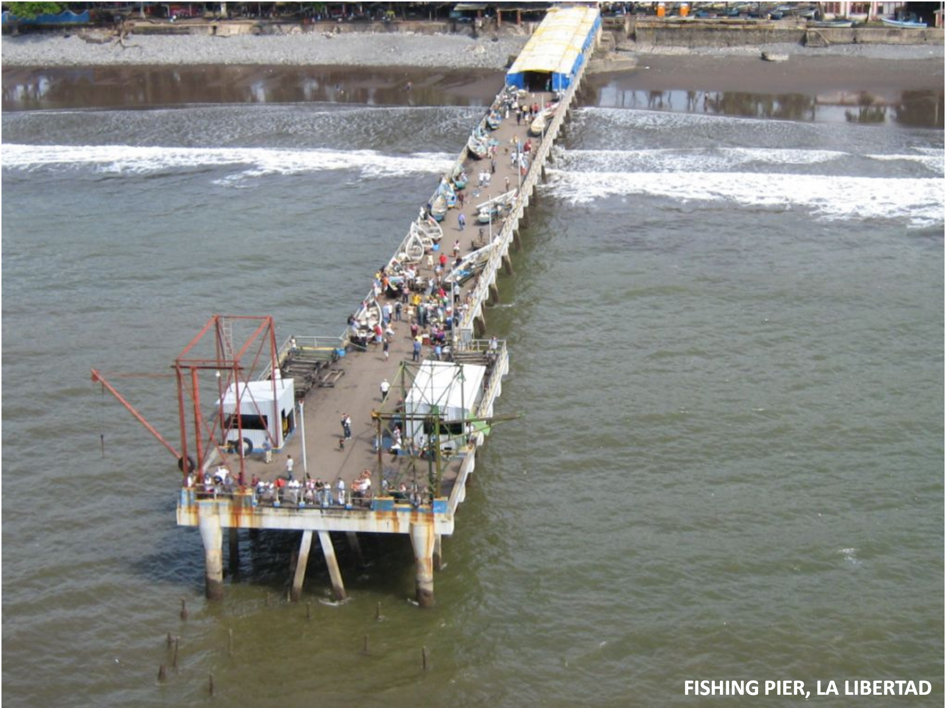
FISHING PIER, LA LIBERTAD