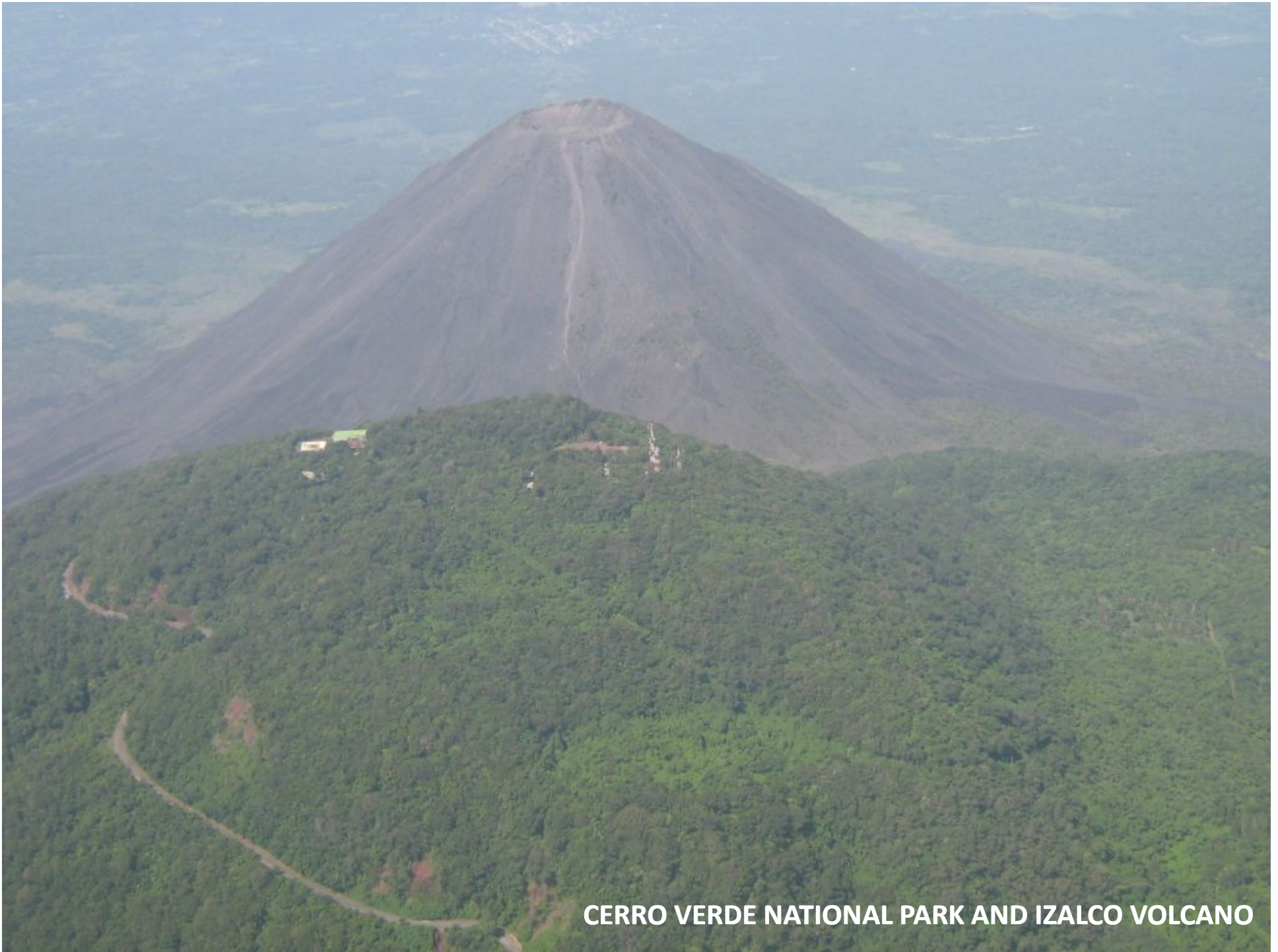
CERRO VERDE NATIONAL PARK AND IZALCO VOLCANO