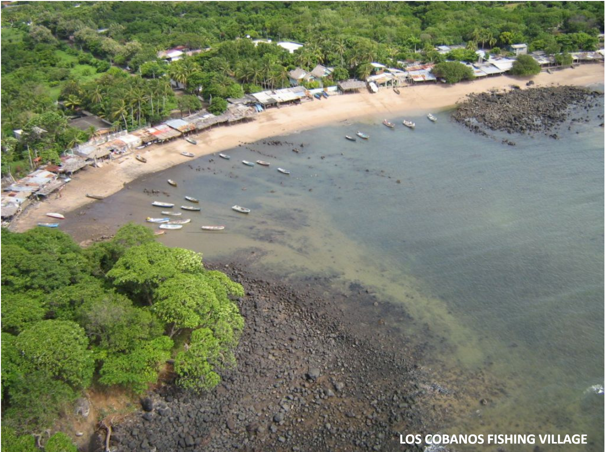
LOS COBANOS FISHING VILLAGE